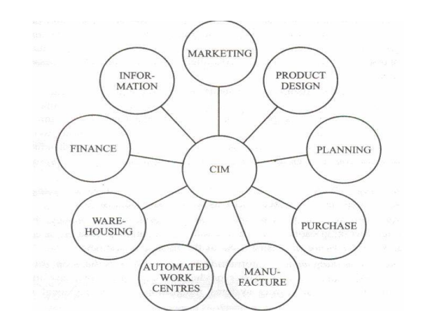
Figure- 2. Major elements of CIM systems

Marketing: The need for a product is identified by the marketing division. The specifications of the product, the projection of manufacturing quantities and the strategy for marketing the product are also decided by the marketing department. Marketing also works out the manufacturing costs to assess the economic viability of the product.